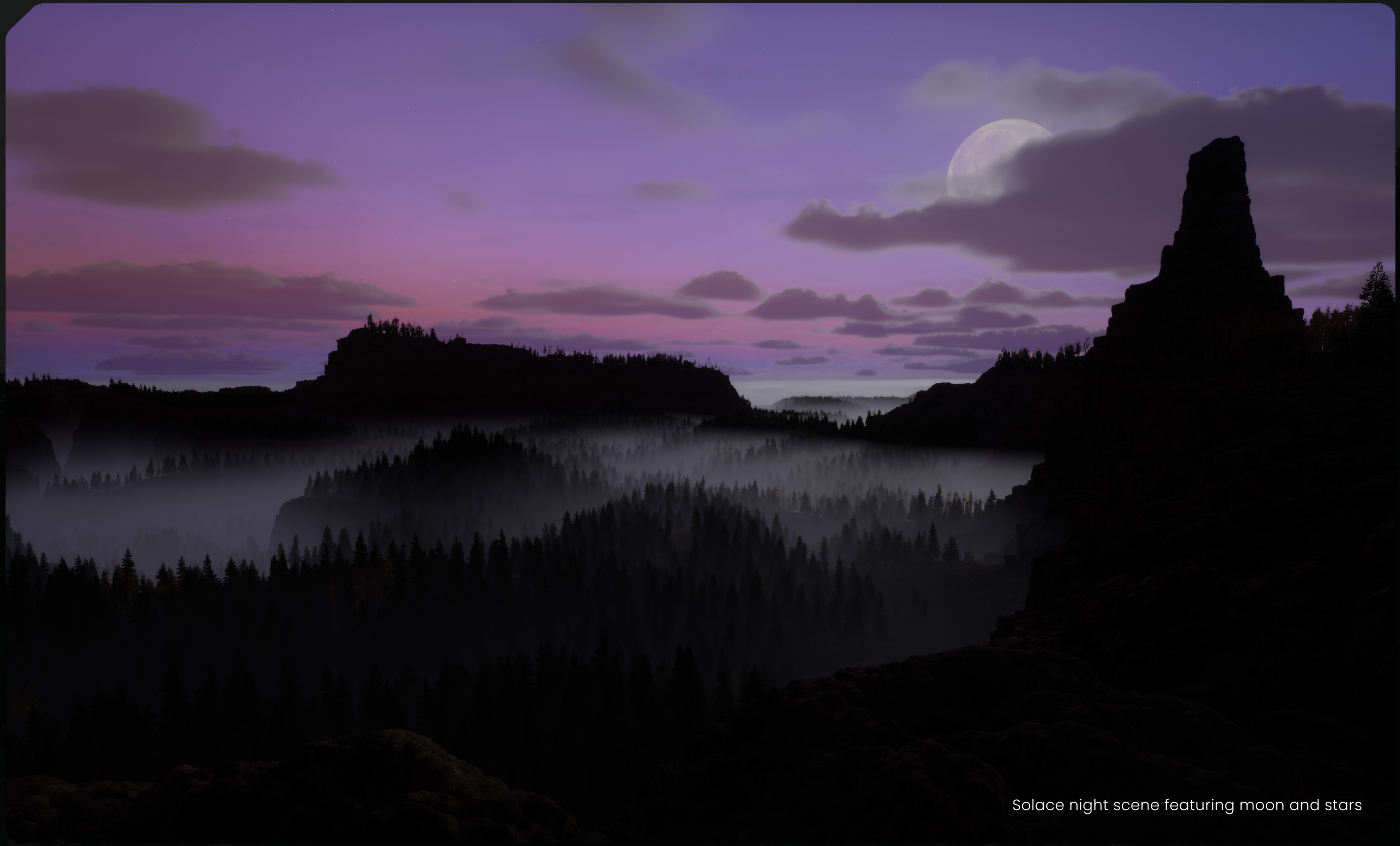
Solace night scene featuring moon and stars